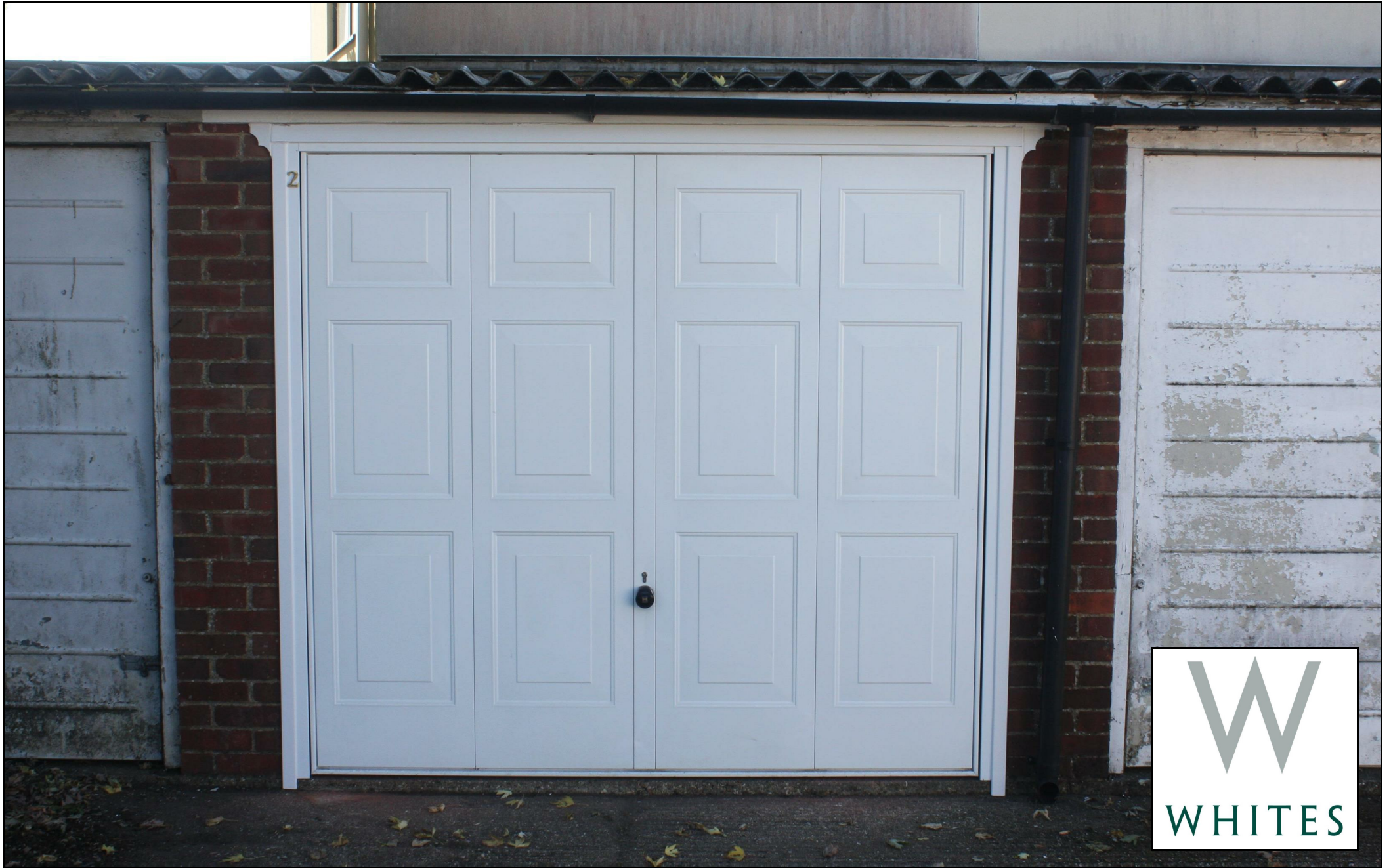
Garage 2, St Francis Road, Salisbury, Wiltshire, SP1 3QP